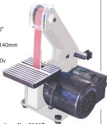
Item No. 7065B